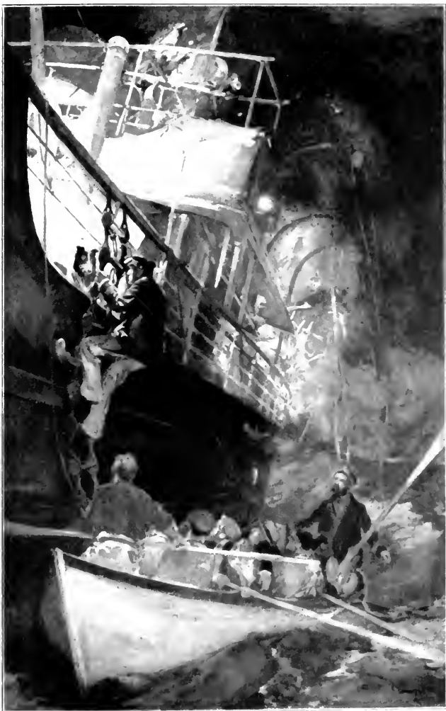
"He was the first to get down."